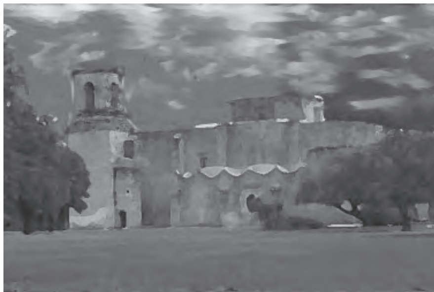
Painting of present-day La Bonita, as a state park and museum.

In the 1770's, the Spanish authorities built Fort Flores approximately one mile from the Mission, and a small force of about 30 soldiers protected the area. In the late 1790's, smallpox ravaged the native tribes and almost led to an end of the Mission, but the leadership of Father